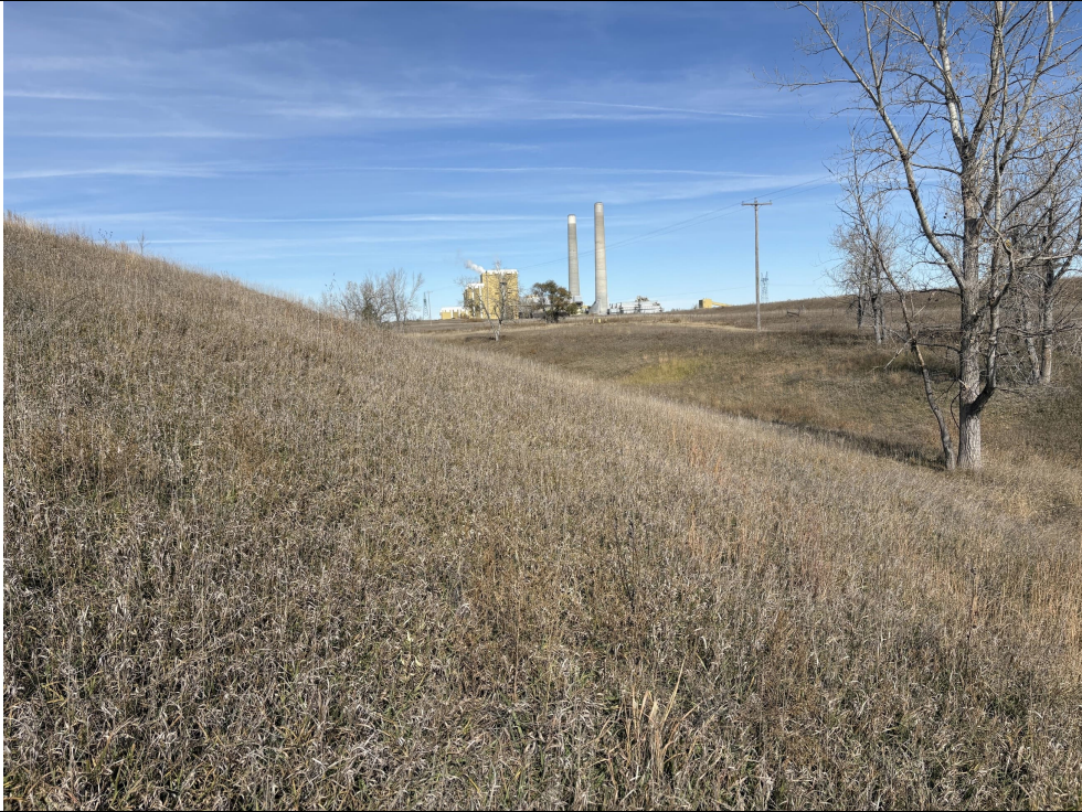
Photograph 13 East exterior slope at Ash Landfill No. 4