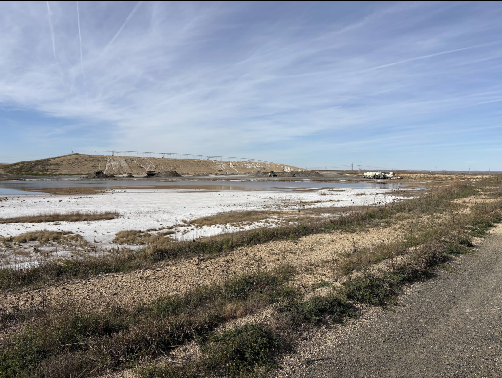
Photograph 14 Contact water evaporation pond and bottom ash handling area