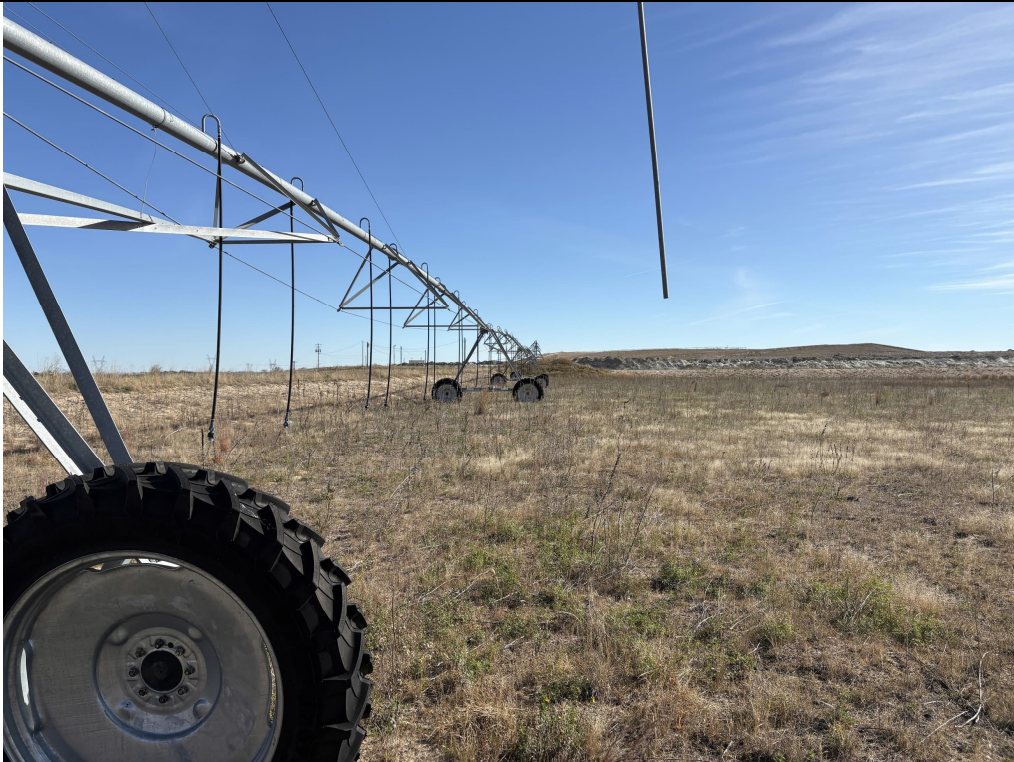
Photograph 2 West (inactive) cell of Ash Landfill No. 3