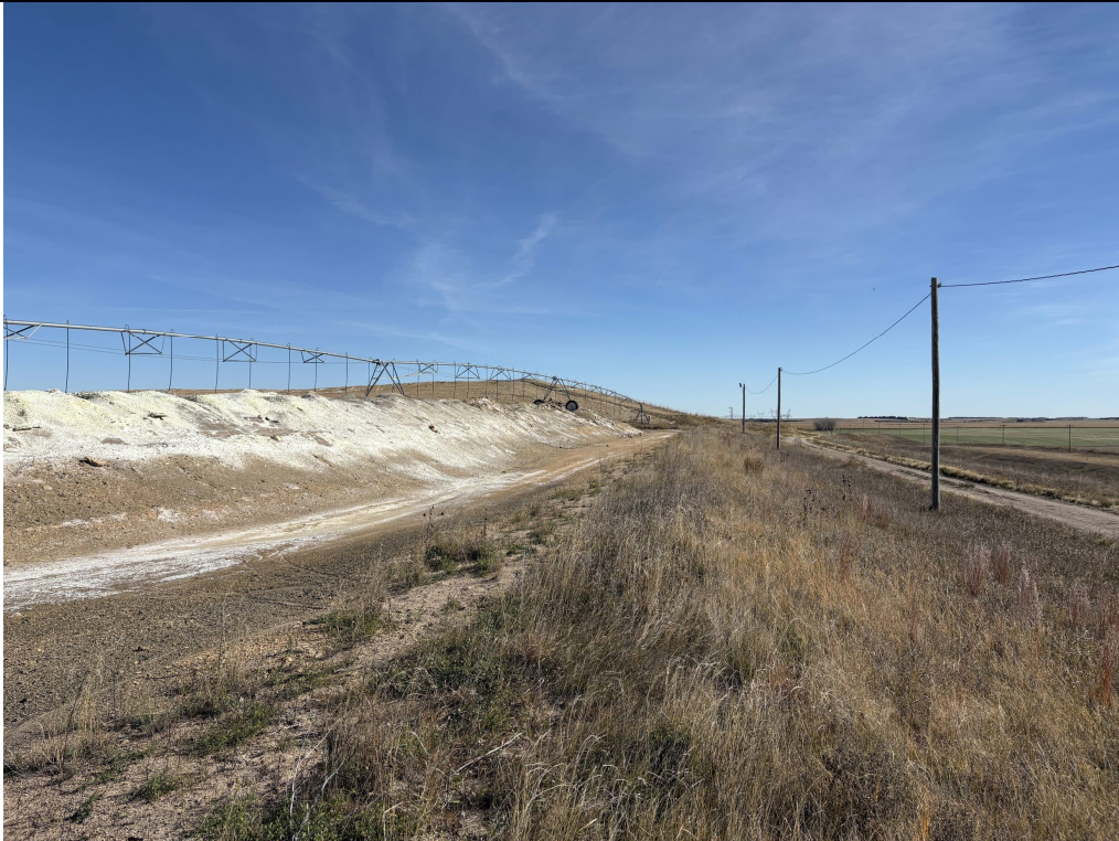
Photograph 8 Ash contact water containment berm south side of Ash Landfill No. 3