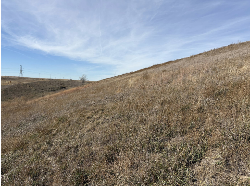
Photograph 11 South exterior slope at Ash Landfill No. 4