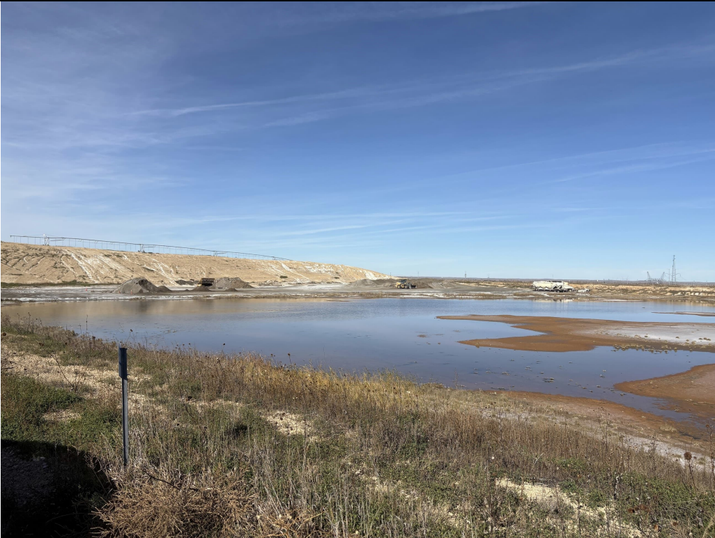
Photograph 4 Contact water evaporation pond