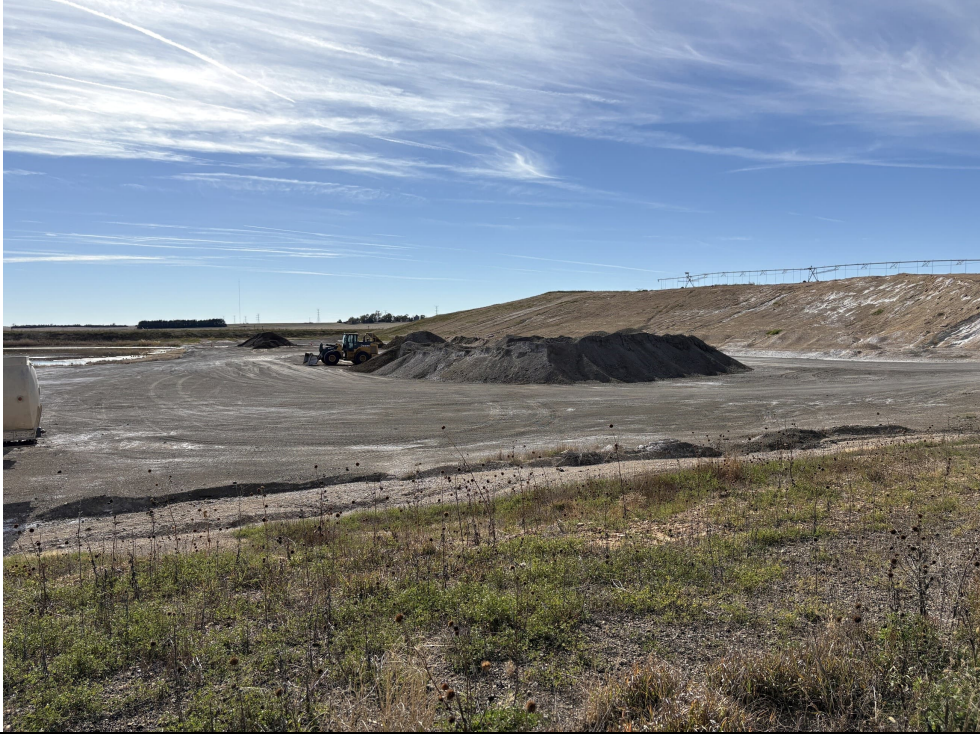
Photograph 15 Bottom ash handling area