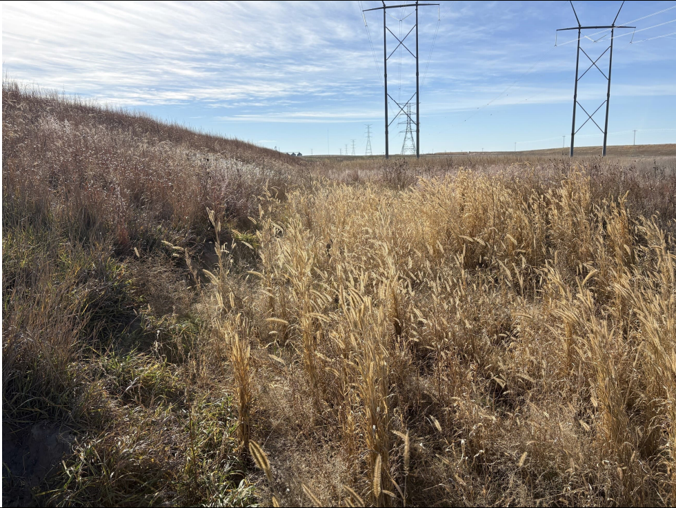
Photograph 1 Erosion repairs west of Ash Landfill No. 3