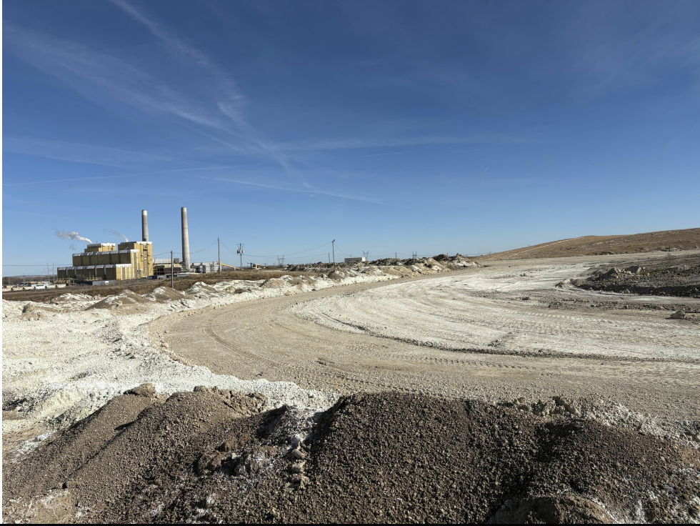
Photograph 5 Active deposition area of Ash Landfill No. 3.