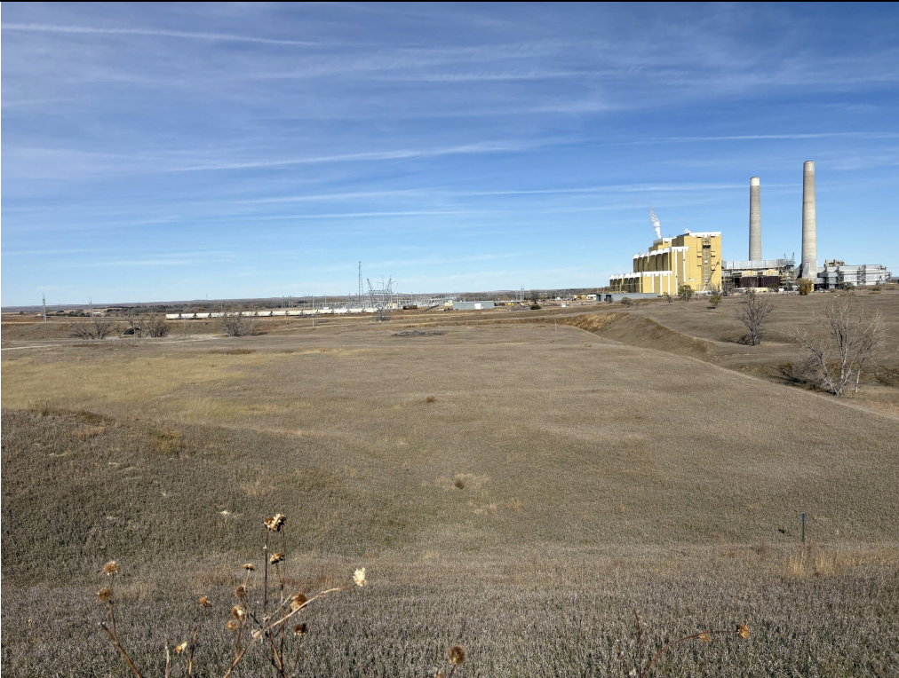
Photograph 16 North exterior slope of Ash Landfill No. 4