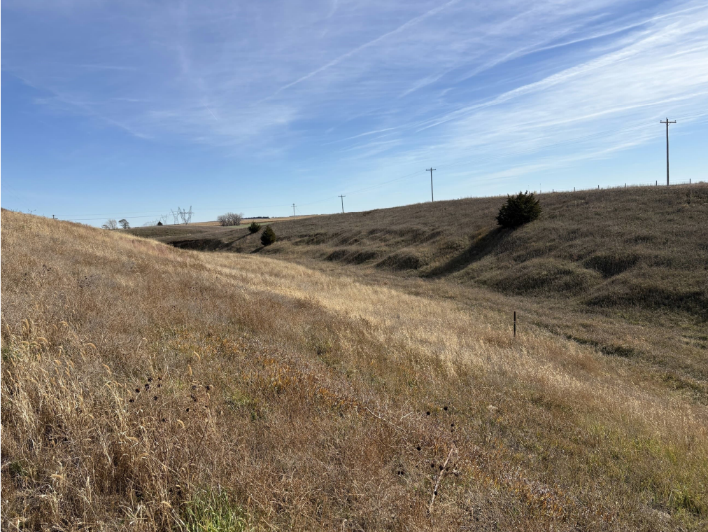
Photograph 12 Southeast corner exterior slope at Ash Landfill No. 4