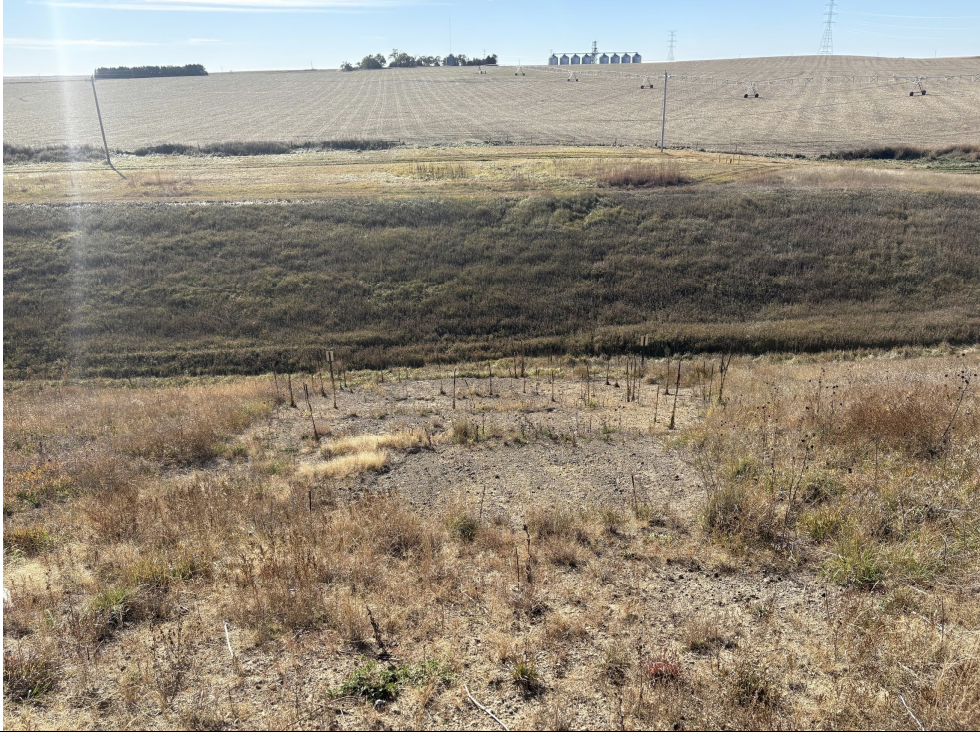
Photograph 3 Area with thin vegetation on south of Ash Landfill No. 3