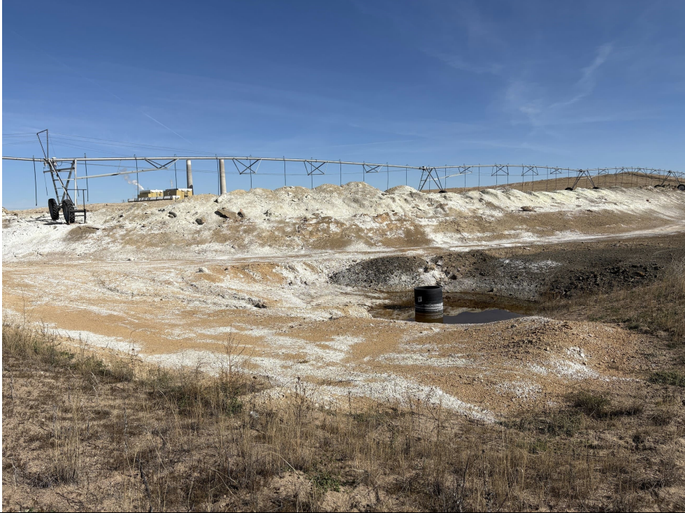
Photograph 7 Sump area in east cell of Ash Landfill No. 3