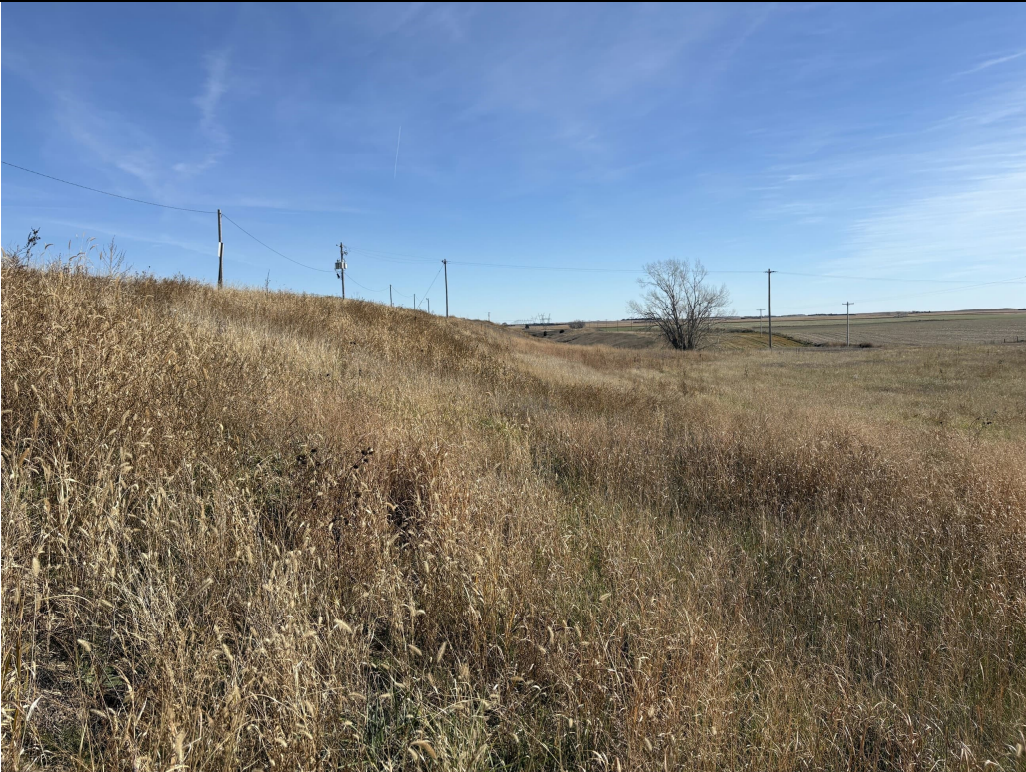
Photograph 6 North slope of Ash Landfill No 3 and closed Bottom Ash Landfill