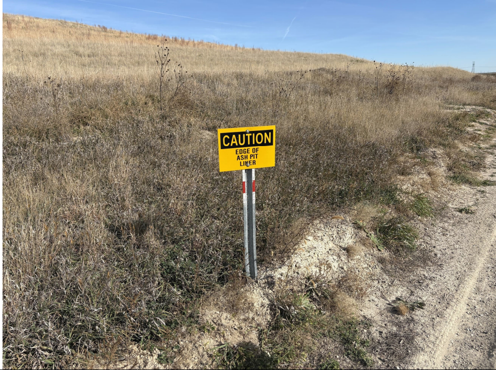
Photograph 9 Edge of liner marker on Ash Landfill No. 4