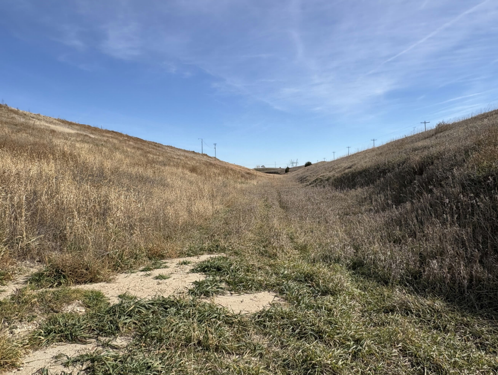
Photograph 10 South exterior slope and drainage channel at Ash Landfill No. 4