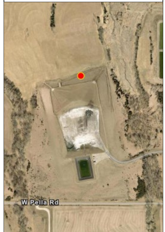
Photo Caption: Vegetation near outside toe of north exterior slope.

Lancaster County, NE GIS, Maxar | Esri Co... P