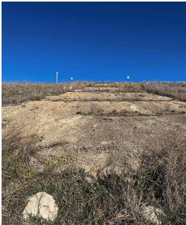
Photograph 4 Sparsely vegetated south exterior slope of Ash Landfill No. 3. (IMG_4199.JPG)