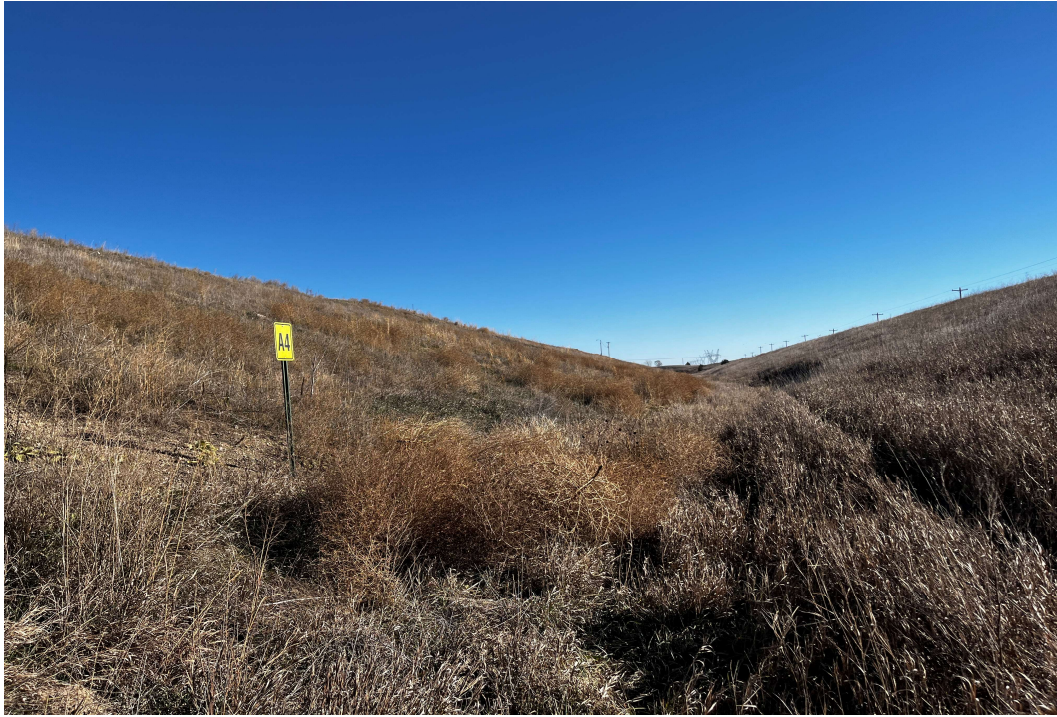
Photograph 5 South exterior slope of Ash Landfill No. 4. (IMG_4203.JPG)