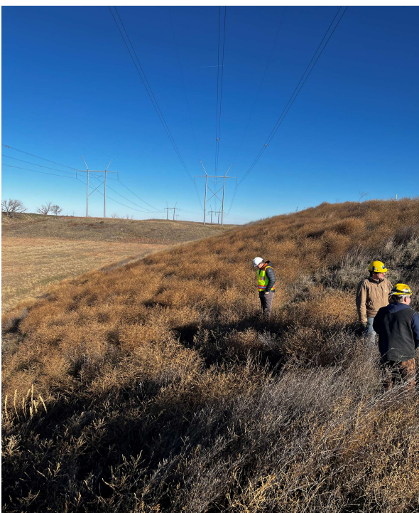
Photograph 2 West exterior slope of Ash Landfill No. 3. (IMG_4175.JPG)