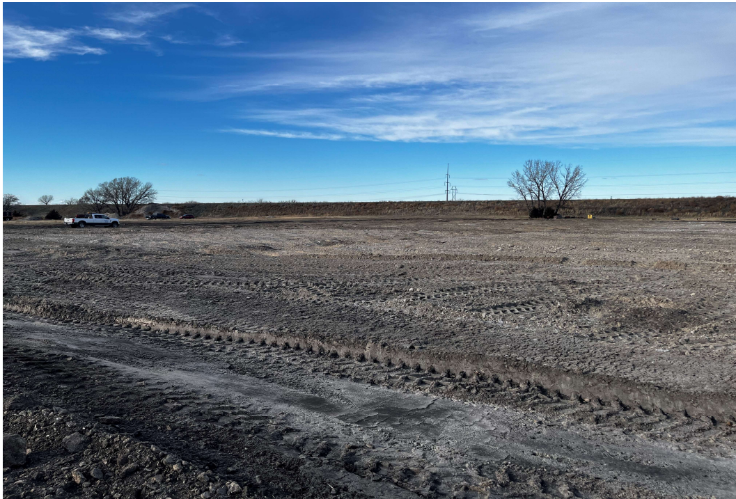
Photograph 1 West cell of Ash Landfill No. 3. (IMG_4166.JPG)