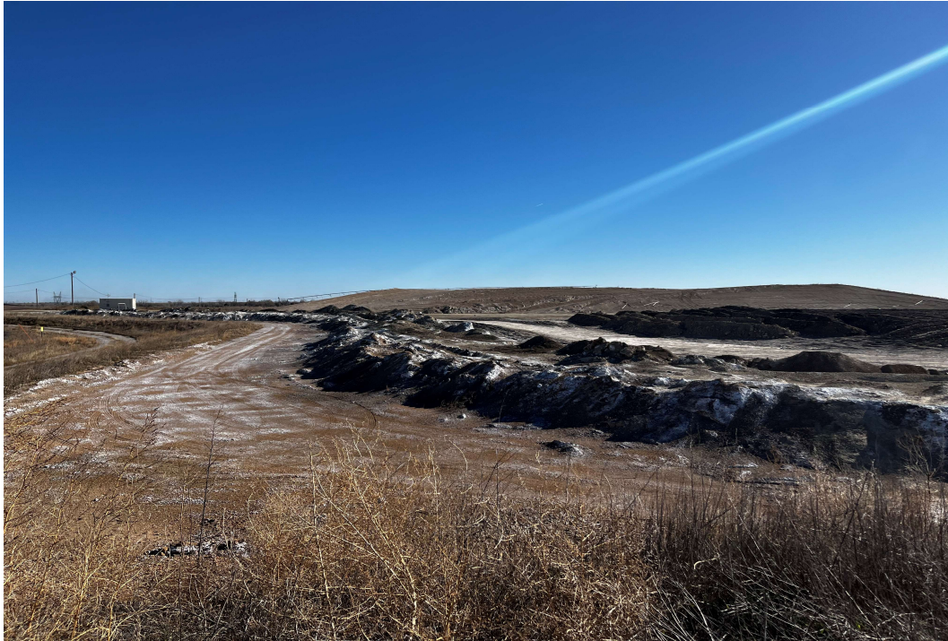
Photograph 3 Ash deposition on the east side of Ash Landfill No. 3. (IMG_4191.JPG)