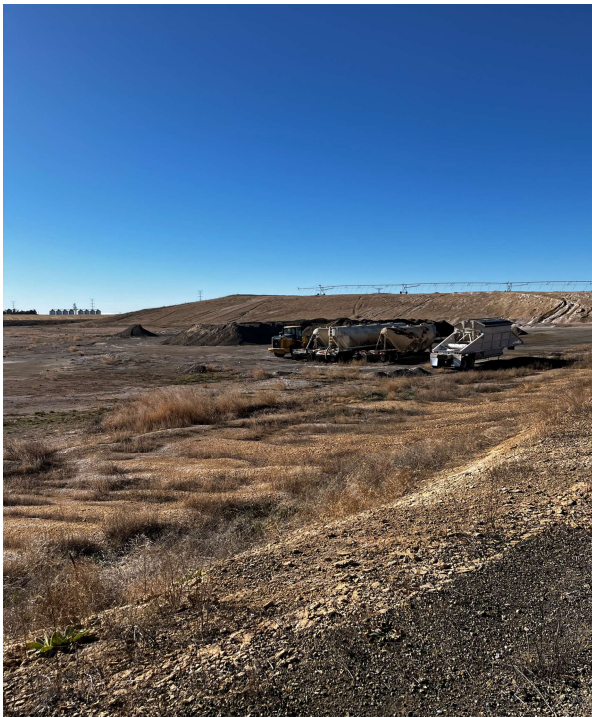
Photograph 8 Bottom ash handling area. (IMG_4213.JPG)