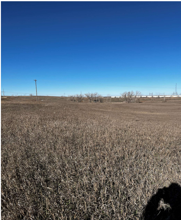
Photograph 9 North exterior slope of Ash Landfill No. 3. (IMG_4216.JPG)