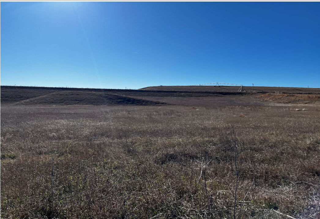
Photograph 10 North exterior slope of Ash Landfill No. 4. (IMG_4219.JPG)