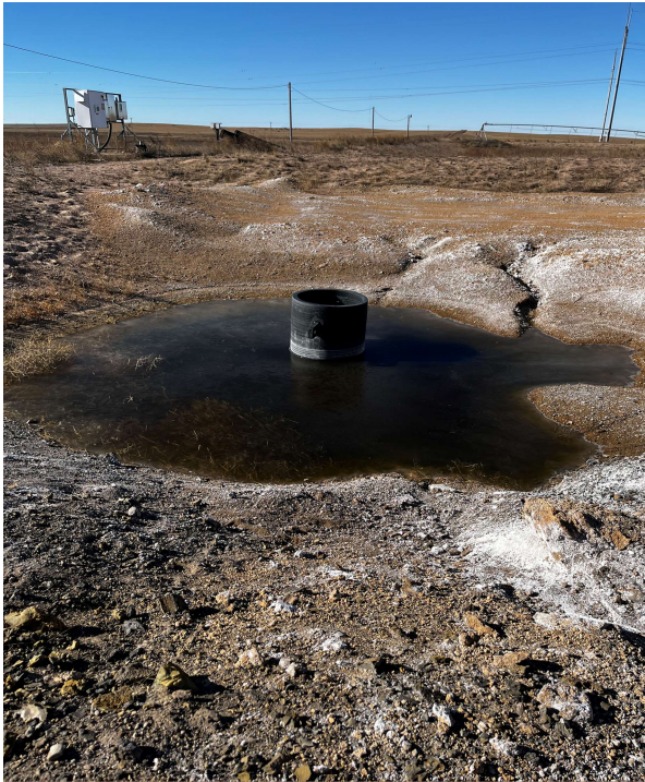
Photograph 7 Leachate sump in east cell of Ash Landfill No. 3. (IMG_4210.JPG)