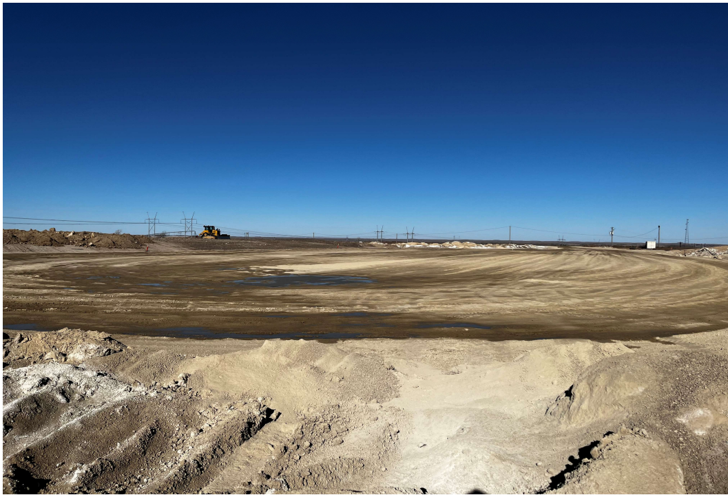
Photograph 6 Active deposition area of Ash Landfill No. 3. (IMG_4209.JPG)